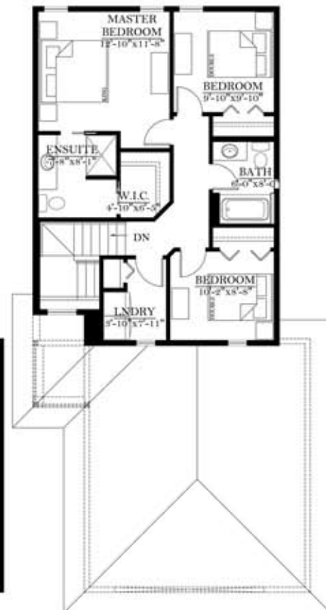
SECOND FLOOR PLAN AREA: 777 SQ FT