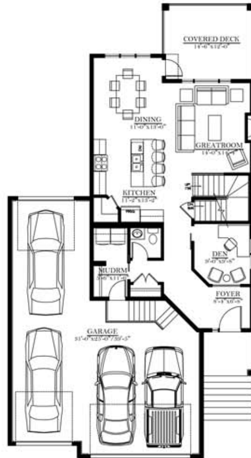
MAIN FLOOR PLAN AREA: 1016 SQ FT